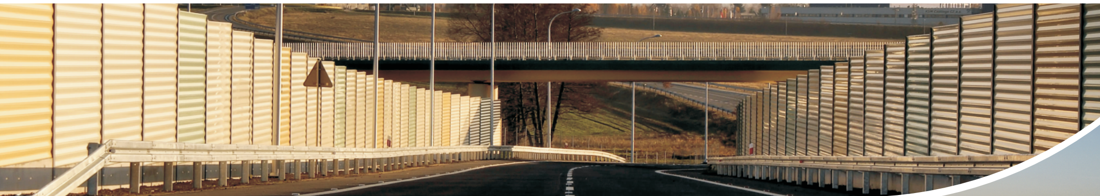
Zittau and Hradek nad Nisou road link.