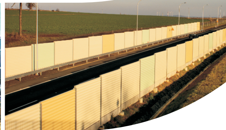
Working plans and specifications of acoustic baffle and its construction within GPO Zopowy station (parcel n° 34/9, ul. Polna, Głubczyce).